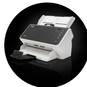
Alaris S2040/S2050/S2070 Scanners