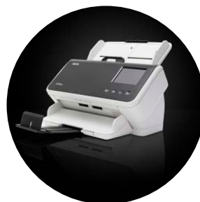
Alaris S2060w/S2080w Scanners

Sales@UniLinkinc.com | www.UniLinkinc.com | 800.666.2980